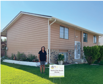
Ward II: 6190 Olive St.