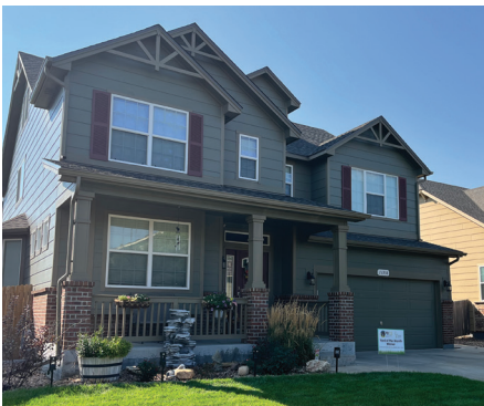
Ward IV: 16822 Parkside Dr. S

Congratulations to all of this summer's winners for their contributions! To learn more about the MyC3 program and find ways to get involved in making your home and neighborhood shine, visit c3gov.com/MyC3 .