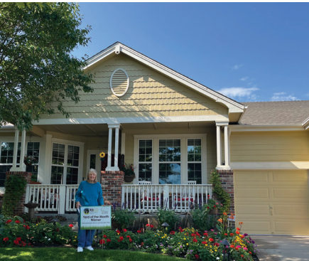
Ward III: 11336 River Oaks Ln.