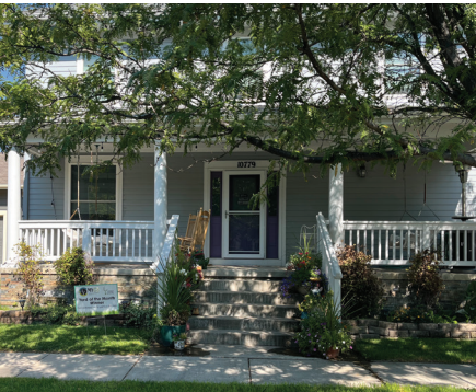
Ward I: 10779 Akron St.

The program is part of the city's MyC3 initiative, which encourages residents to get involved in projects and activities that improve neighborhoods and foster community pride. From maintaining beautiful yards to participating in citywide programs, MyC3 inspires residents to take small steps that make a big difference in how Commerce City looks and feels.