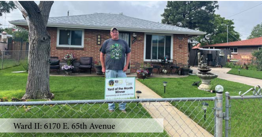
Ward II: 6170 E. 65th Avenue