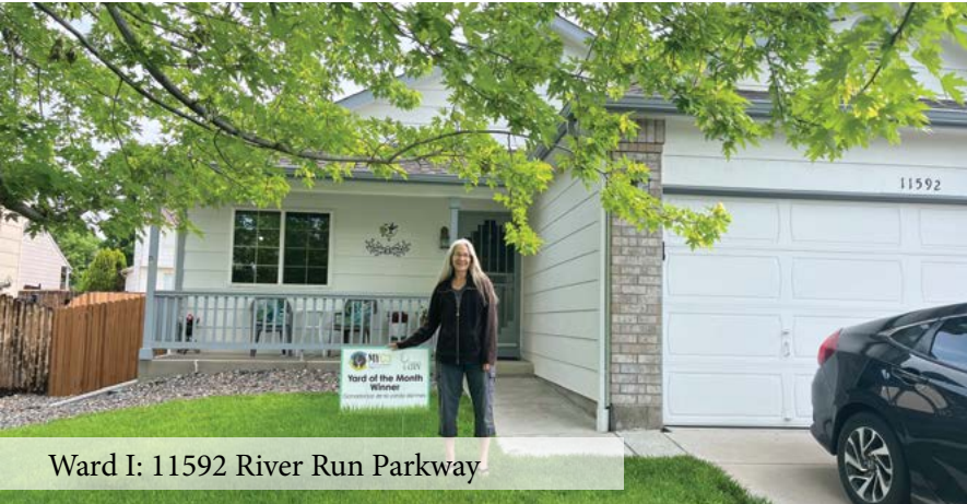
Ward I: 11592 River Run Parkway

We are proud to recognize our first set of winners for the 2025 season: