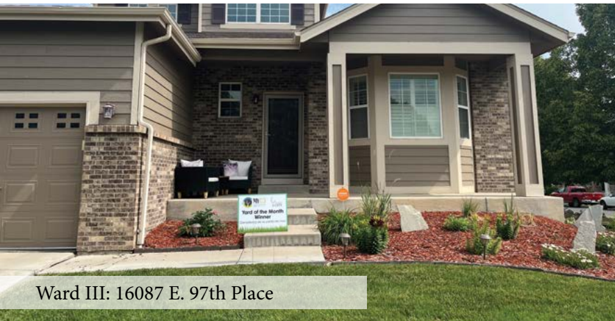
Ward III: 16087 E. 97th Place