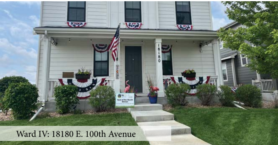
Ward IV: 18180 E. 100th Avenue

Thank you to these residents for setting a high standard and helping to make Commerce City a more welcoming and vibrant place to live! Do you know a yard that deserves the spotlight? Nominations are open all summer long! All homes nominated through the end of each month will be considered for recognition the following month. Submit your nominations at bit.ly/MyC3Yard .